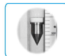
Float with PTFE Ring avoids glass to metal contact and minimizes possibility of Glass Tube breakage